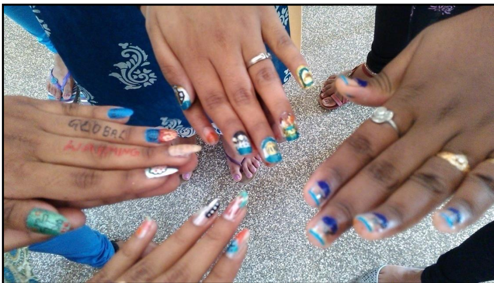
Nail art on eco themes