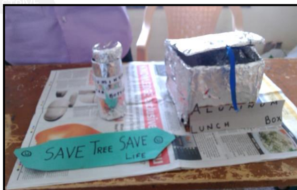
Junk Art created by students on display