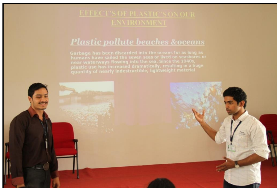
Paper presentation on Effects of plastics on Environment by a student

Enviro Club of the College aims at creating awareness on various issues related to Environmental Safety And Energy Conservation. In this regard, an inter-departmental competition “BONE-14”(BUILD OUR NATURAL ENVIRONMENT) was conducted in association with Zenith Management Association. Students participated in events like paper presentation, junk art (without using plastic), collage and nail art.